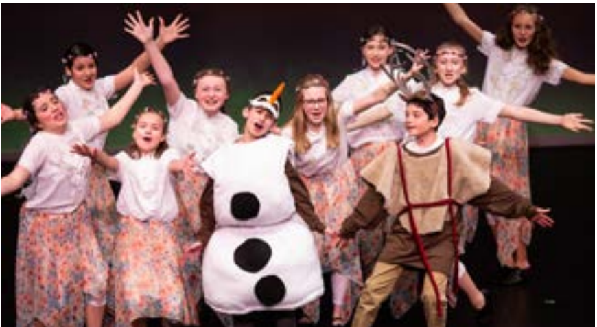
Frozen

If your student is in 1st grade or younger, please refer to our Young Arts Program.