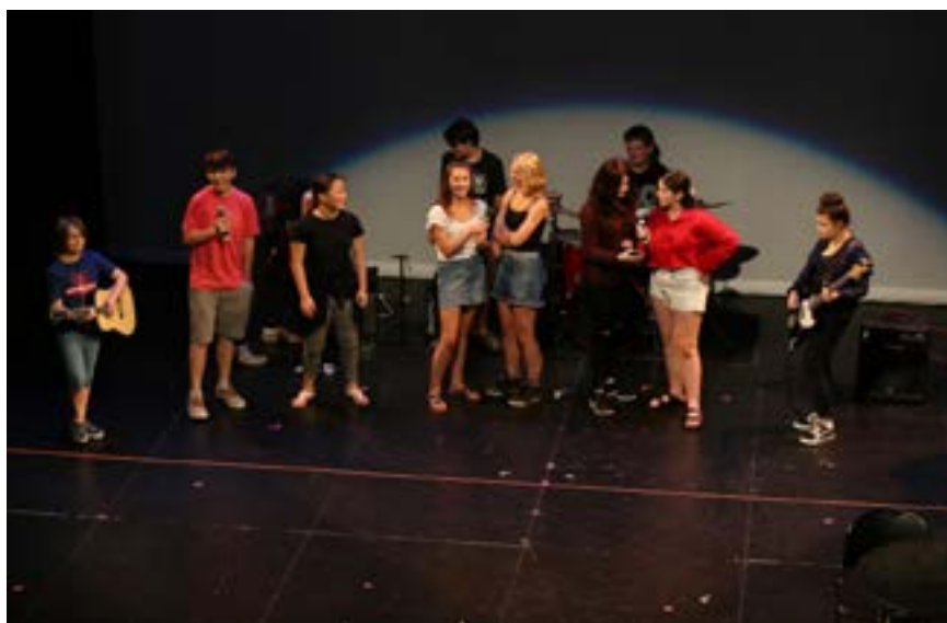
C.A.K.E Noontime Show

Creative Arts at Keene (C.A.K.E.) is an NEA award winning, fun-spirited multi-arts summer camp with classes in art, creative writing, dance, drama, music, photography, technical theatre, video production, and more!