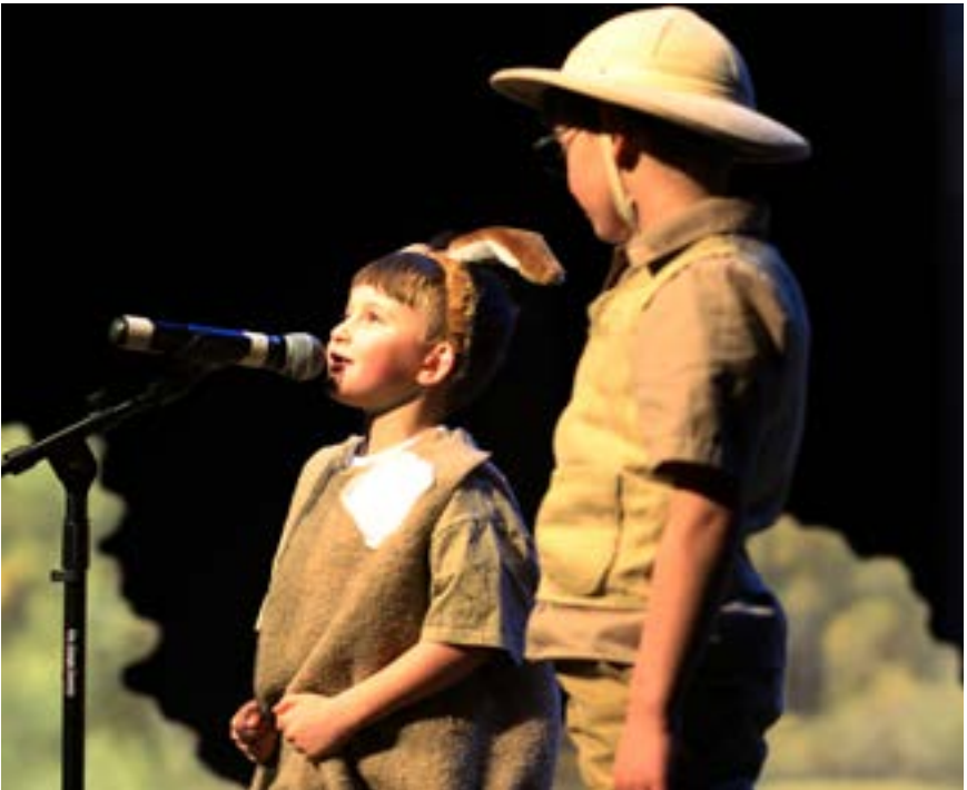
Oh Say Did You See?

Students in 2nd grade may choose whether to stay in Young Arts for one more year, or move on to our Dance and Theatre programs.