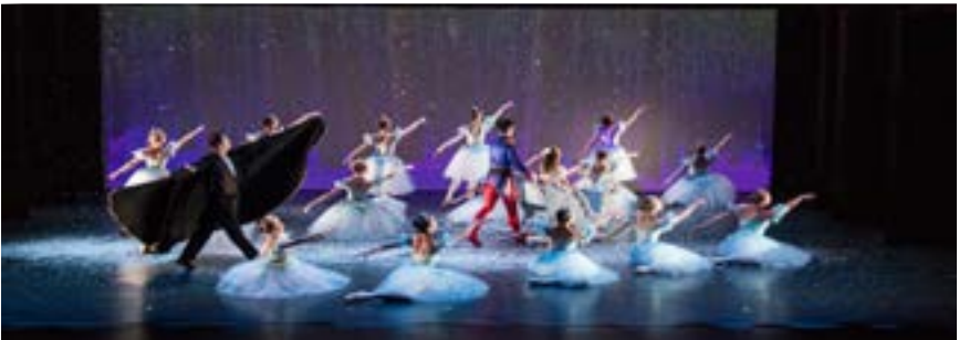
The Nutcracker - Photo by Steve Holmes Photography

MoCo's culture successfully combines inclusiveness, encouragement and respect, with rigor, high-expectations and professionalism. Students are nurtured, encouraged to take risks, make mistakes, and build self-confidence to accomplish individual and collective goals. MoCo kids take their confidence onto the stage, into the classroom and into the community. They are our future leaders. And through the transformational effects of arts education, and a little MoCo Magic, the future is bright.