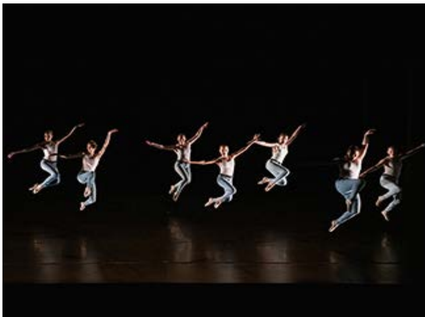
Time to Dance, 2020

If your student is in 1st grade or younger, please refer to our Young Arts Program.