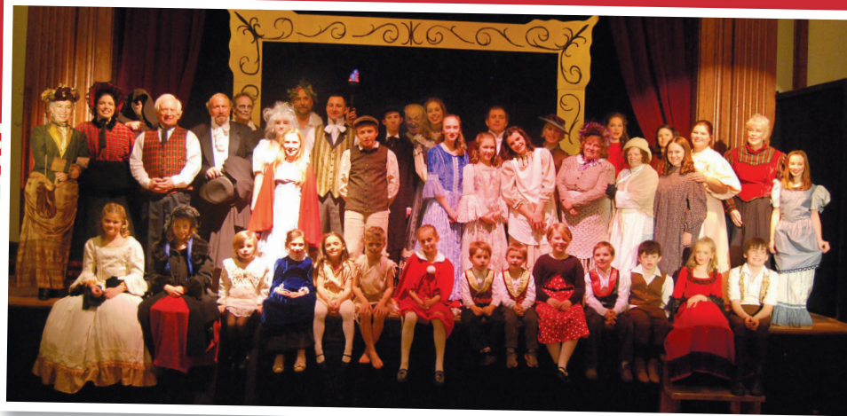
The Walpole Players cast of its seventh annual benefit production of the Charles Dickens classic "A Christmas Carol."