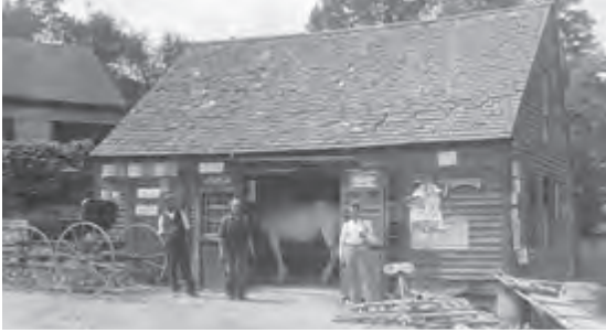
These men are at the Spofford Village blacksmith shop that was in business circa early 1900s. The blacksmith shop was in business for many years.

This week, The Monadnock Shopper News presents the 54th annual “Yesterday and Today” Established Edition. This year’s annual section is the largest ever with a record number – 444 – local businesses and organizations participating.